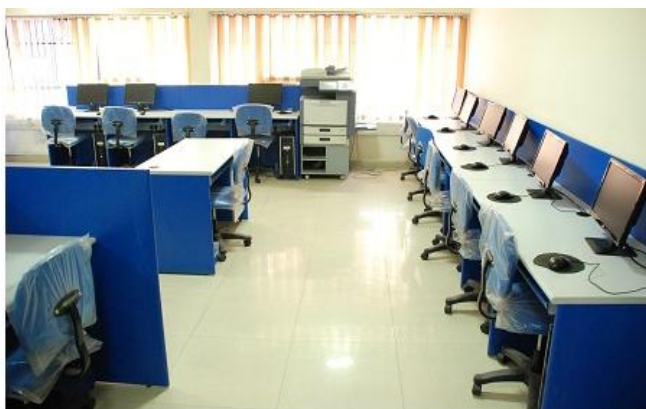
Cyber Lab., CDTI Chandigarh