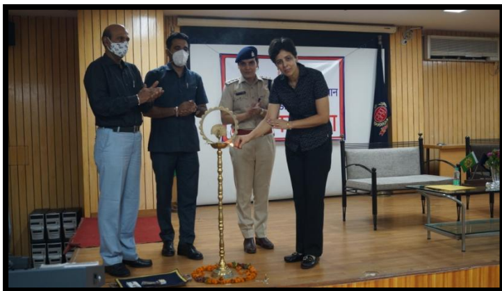
Hindi Pakwada was organized at CDTI Chandigarh, in which various competitions (Essay, Slogan Writing etc.) were conducted