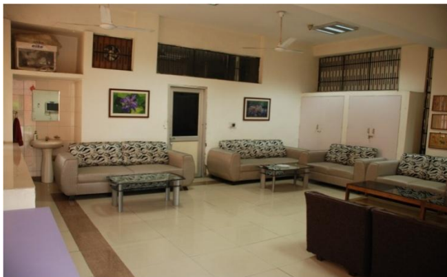
Recreation Hall at CDTI Chandigarh