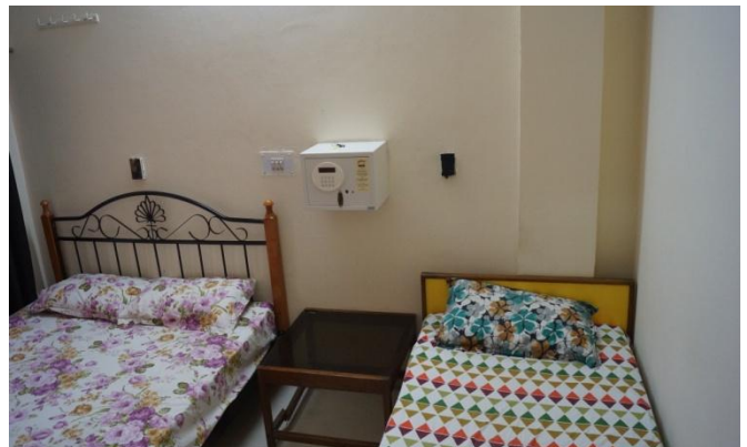
Hostel Room at CDTI's Campus Chandigarh