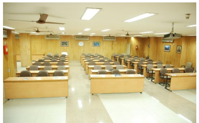
Classroom, CDTI Chandigarh