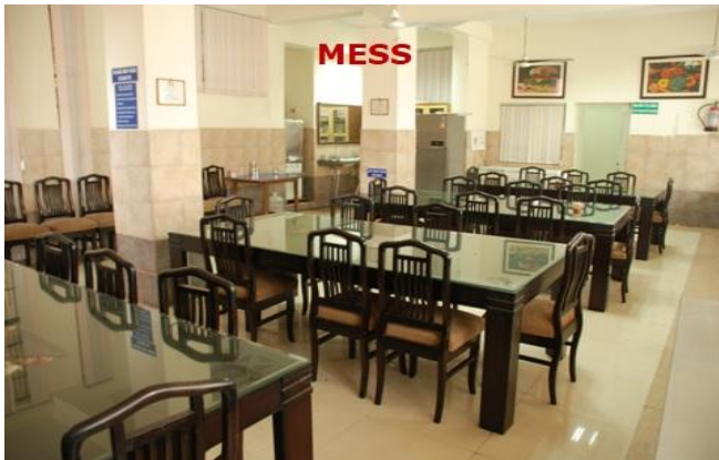
Mess at CDTI Chandigarh