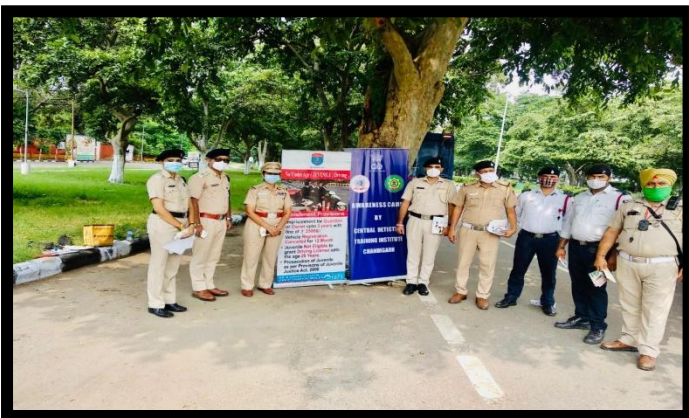
A traffic awareness programme organized by CDTI Chandigarh on occasion of foundation day of CDTI Chandigarh on 30.09.2021.