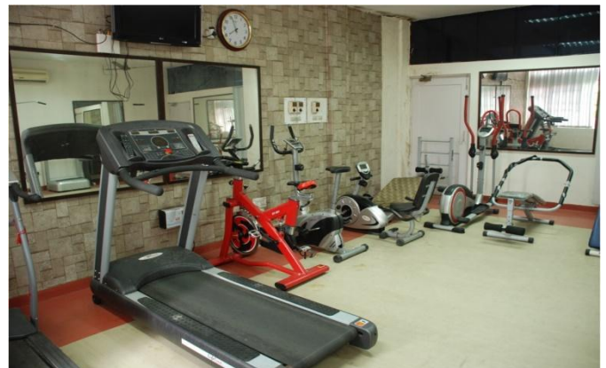
GYM at CDTI Chandigarh